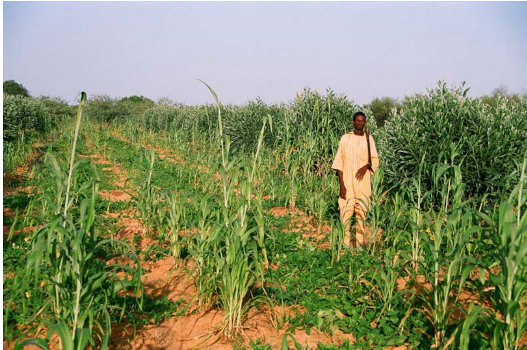
Figure 3. A typical FMAFS showing multi-purpose Acacias and annual crops.

The FMAFS retains and promotes all the benefits of FMNR: biodiversity is enhanced; a diversity of trees produces firewood, timber, fodder for animals, human food, and medicines while restoring the land through protecting soils from erosion and improving fertility. The Australian acacias are extremely fast growing, fix nitrogen and provide firewood, timber, mulch and nutritious food (21% protein, 50% carbohydrate, 7% fat, with vitamins) for humans and animals, while contributing to environmental restoration and crop protection. The annual crops provide food and income as well as crop residues for animal fodder and CRM. Farmers have the flexibility to spread compost, animal manure, other organic residues or micro-dose mineral fertilizers to their annual cropping areas. Farm labor and income are spread throughout the year which gives resilience to families and helps to buffer against crop loss due to drought or insect attack.