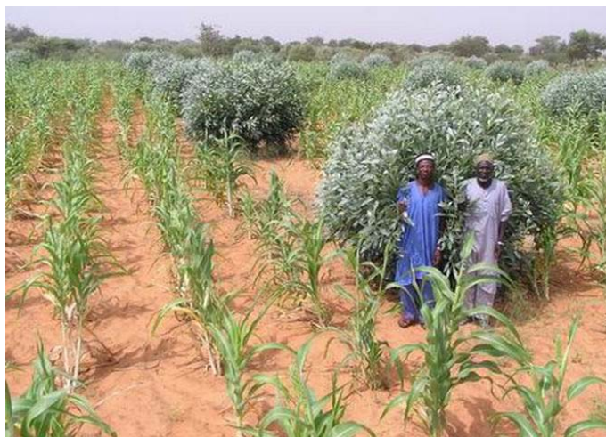
A typical FMAFS in Niger